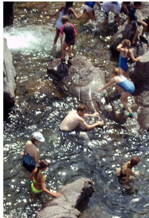
Johnson's Shut Ins State Park